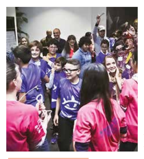
France: An information day for children with MS and their families.

Although MS will sometimes make certain sports or activities more difficult, children with MS should not feel they need to stop being active and rest all the time.