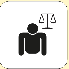
Severe balance issues