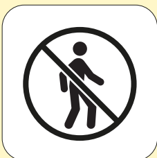
Inability to walk