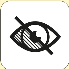
Changes in vision