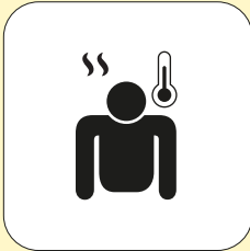
Increased body temperature