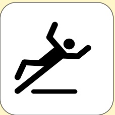
Falls with injury